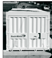
City of Pomona 1000 GPM Nitrate Removal Unit

As for reliability, one senior City engineer associated with the project reports that the system has been running "flawlessly."