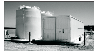
City of Avondale 2000 GPM Nitrate Removal

In an environment where technology is advancing as quickly as regulations change, it's prudent for water agencies to team up with a water treatment partner that is a proven part of the research and development vanguard. This real-world experience and forward-looking expertise helps prevent them from getting stranded with outdated or unreliable solutions, and ensures maximum return on their investment in nitrate removal technologies.